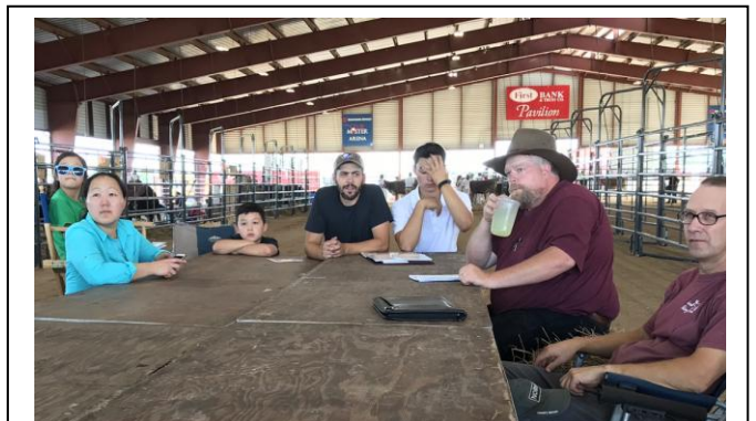
Fall Gathering 2018 in the barn at the Virginia State Fairgrounds

Identifying bulls from which to draw semen; Creating a Will and How do you liquidate a herd; Genetic Identification of bulls; Hire a consultant to develop a Protocol for AI; Possibility of Colonial Williamsburg storing the semen or maybe have a bull to service cows; Premium Best Bulls - identify them using the Bull Soundness Exam (BSE); Developing a genetic base for females; and finding a reputable semen collector/storer.