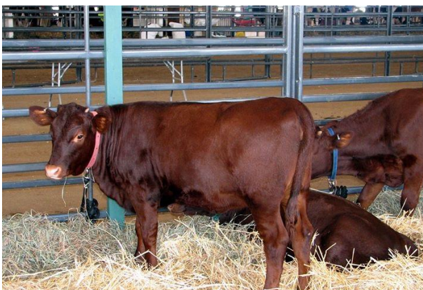
Some beautiful Devons patiently awaiting their turn in the ring