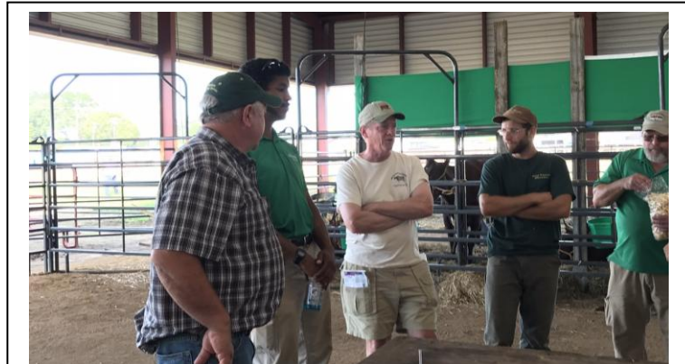
AMDCA Regional Meeting held at the Mid-Atlantic Regional Show